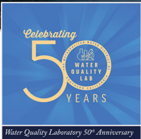
Water Quality Laboratory 50 th Anniversary

Water Treatment Plants: Joseph Jensen, Granada Hills (capacity 750 million gallons per day); Robert A. Skinner, Winchester (350 mgd); F.E. Weymouth, La Verne (520 mgd); Robert B. Diemer, Yorba Linda (520 mgd); and Henry J. Mills, Riverside (220 mgd)