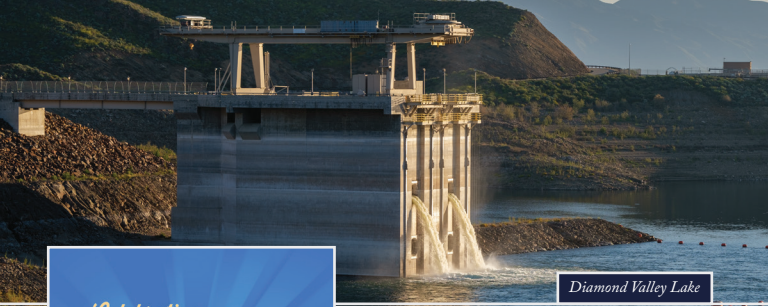
Diamond Valley Lake