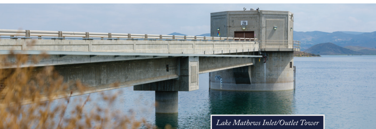
Lake Mathews Inlet/Outlet Tower

Uses of Funds: State Water Project payments, 26%; operations & maintenance, 26%; debt service, 13%; construction, 15%; fund deposits, 11%; demand management programs, 2%; supply programs, 3%; and Colorado River power, 3%; other 0% (Biennial Budget FY 2024/25, FY 2025/26)