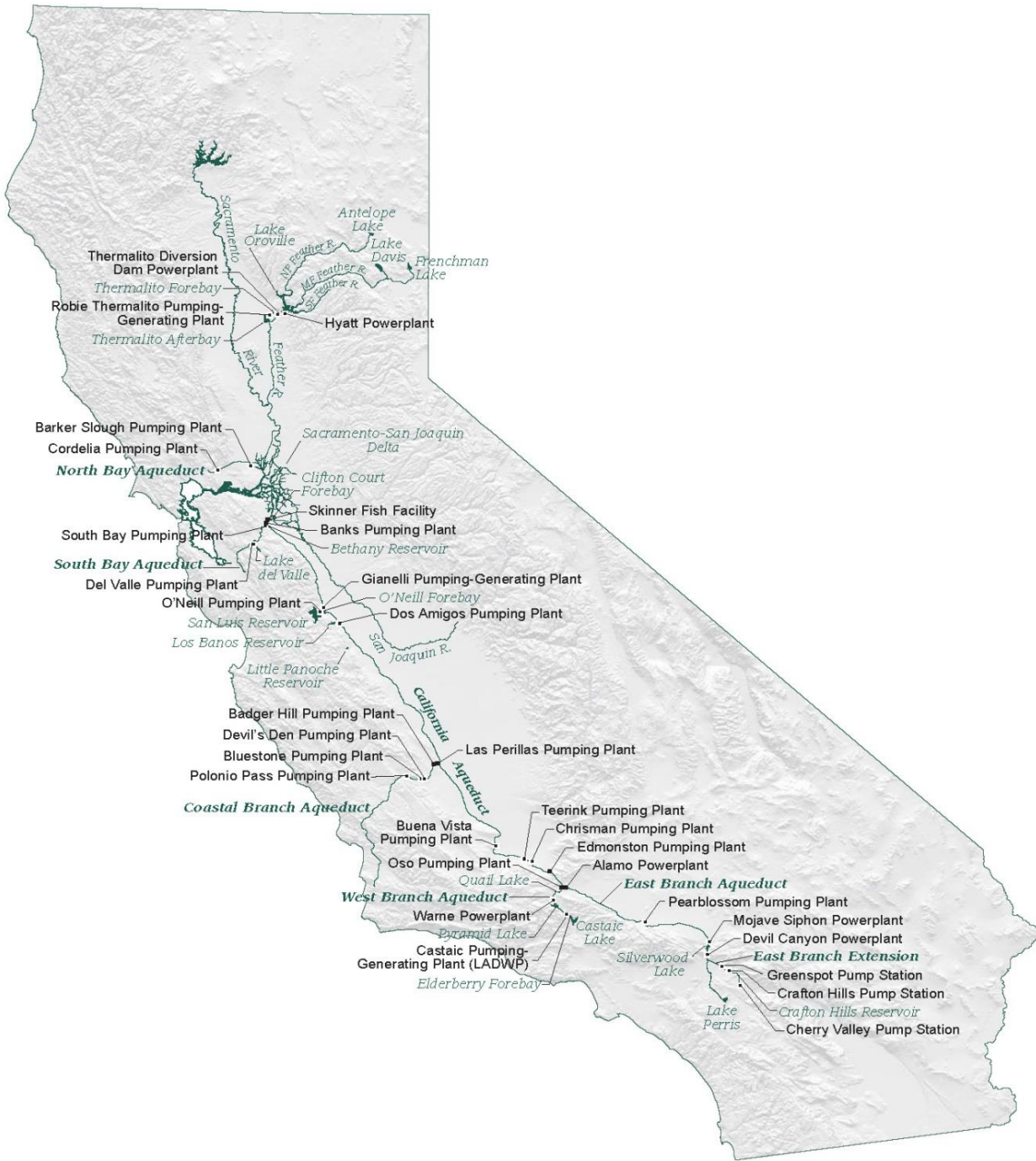
Figure 1. Facilities of the State Water Project