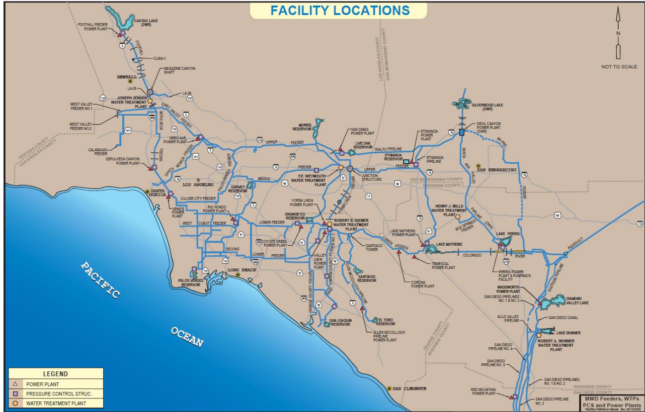
Figure 3. Metropolitan’s Distribution and Storage Facilities

Metropolitan has an ongoing commitment, through physical system improvements and the maintenance and rehabilitation of existing facilities, to maintain the reliable delivery of water throughout the entire service area. System improvement projects include additional conveyance and distribution facilities to maintain the dependable delivery of water supplies, provide alternative system delivery capacity, and enhance system operations. Conveyance and distribution system improvement benefits also include projects to upgrade obsolete facilities or equipment, or to rehabilitate or replace facilities or equipment. These projects are needed to enhance system operations, comply with new regulations, and maintain a reliable distribution system. A list of conveyance and distribution system facilities is provided in Table 3 along with the fiscal year 2018/19 estimated conveyance and distribution system benefits. The potential benefits of the Distribution System allocable to the Standby Charge is shown as part of the $158 million Non-SWP Conveyance and Distribution System line item in Table 1.