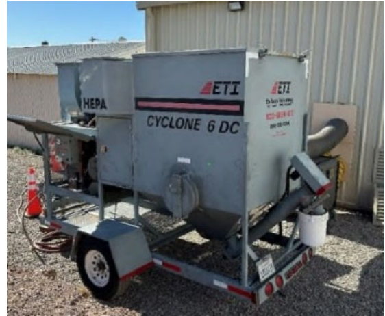
Abrasive blasting booth and dust collector to be used at Desert facilities